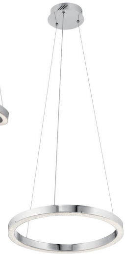
D | 83865