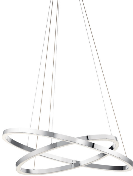
A | 83866