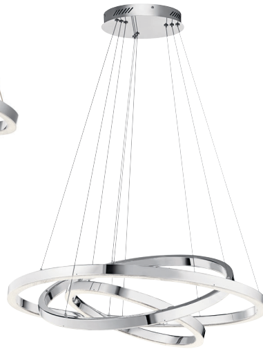
B | 83863